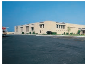
Fort Wayne, Indiana, USA