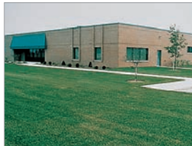
London, Ontario, Canada