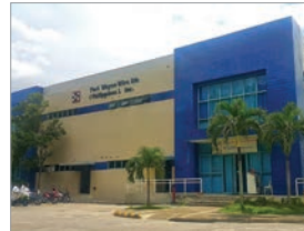
Metro Manila, Philippines