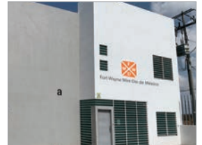
Querétaro, Qro. México