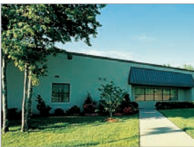
Columbus, North Carolina, USA